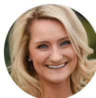
Exhibit Sales Consultant 919-334-0051, ext. 204 (Alpha K-M) eval@MPeshows.com