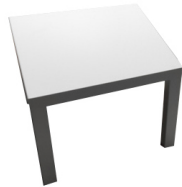
End Table - Square