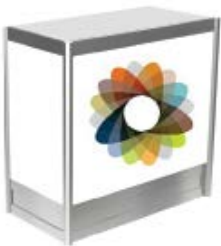
Storage Counter with Front Graphic Panel