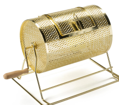
Small Ballot Drum