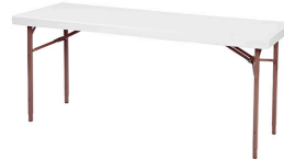
Unskirted Table - 30" High 4ft., 6ft., 8ft.