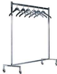
Garment Rack on Wheels