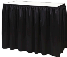
Skirted Counter - 42" High 4ft., 6ft.