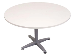
Starbase Table - 30" h