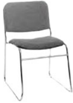
Grey Fabric Side Chair