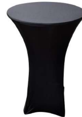
Spandex Cocktail Table Cover