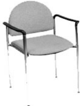
Grey Fabric Arm Chair