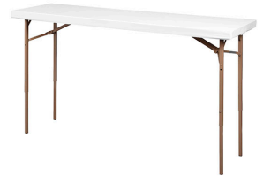
Unskirted Counter - 42" High 4ft., 6ft.