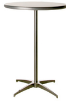
Starbase Table - 40" h (cocktail table)