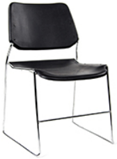
Plastic Contour Chair