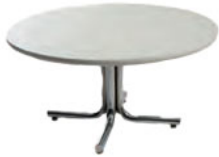
Starbase Table - 18" h (coffee table)