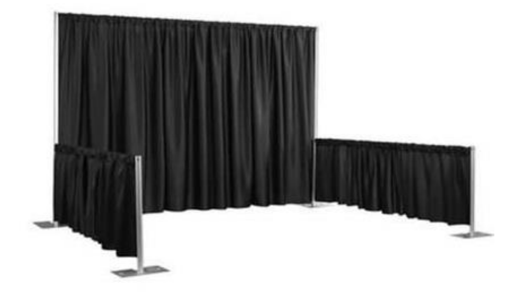
Exhibit booths will have an 8' draped back wall. On each side, a draped side rail will extend from the back of the booth to the front of the booth at a height of 3'. Drape and aisle carpet color are both BLACK .