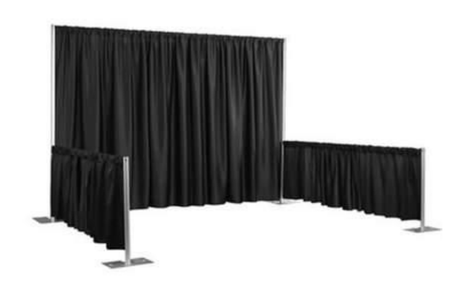
8' high x 10' wide x 3' front to back sides

SIGNS : Sign height may not exceed over the 8' booth height. Exhibitors wishing to hang signs over the 8' height limit are subject to a $500 minimum sponsorship fee which will include the hanging of the sign. No signs over 4'X10' are permitted to be hung without preauthorization from show management. Contact show management BEFORE hanging any sign over 8' as the venue will be responsible for labor and hanging of signs and banners. Signs may be ONE sided only. Signs with writing or logos on both sides are NOT permitted.