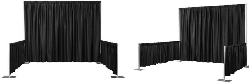
Exhibit booths will have an 8' draped back wall. On each side, a draped side rail will extend from the back of the booth to the front of the booth at a height of 3'. The drape color is black.

Tables, chairs, electricity etc. are not included with the cost of your exhibit booth.