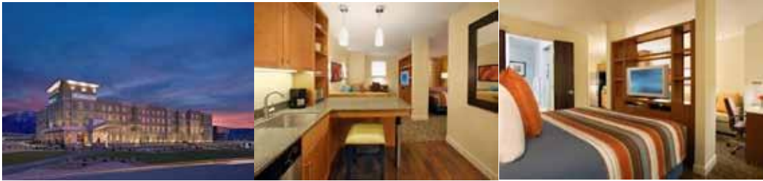
Host Hotel Hyatt House – Sandy, UT

Salt Lake City lodgings offer visitors' superior value compared with many other cities its size. Most hotels are close to entertainment, restaurant, & shopping districts. Airport area hotels are available, but downtown Salt Lake & Sandy locations offer a much more diverse selection. The winter ski season and holiday events attract many visitors, so make reservations well in advance at those times. The South Towne Exposition Center is located in Sandy, Utah 9 miles south of downtown Salt Lake City. The Exhibition Center is 18 miles from Salt Lake City International Airport.