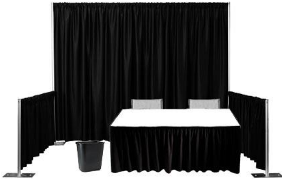
Silver Package (Carpet Not Included)