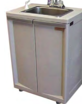
Mobile Hand Washing Sink