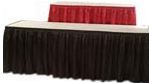
Table Skirt Color: _____ blue _____ red _____ burgundy _____ black _____ green _____ yellow _____ white

(Standard table height is 30in. Add $40 for 40in high skirted table.) (All sizes skirted on three sides. For skirt on 4th side, add $40 on 30in tall table, $60 on 40in tall table)