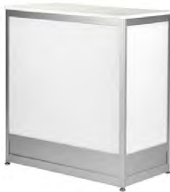
Storage Counter - 40"