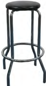
Backless Bar Stool