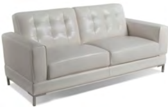
Leather Sofa - 3 Seater