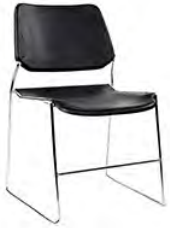
Plastic Contour Chair