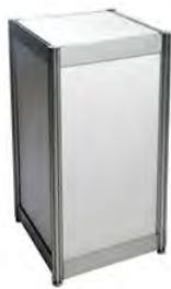
36" High Pedestal