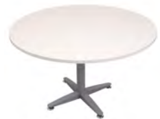
Starbase Table - 30" h