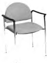
Grey Fabric Arm Chair