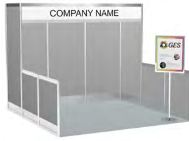
22"w x 28"h Vertical Sign