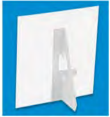
8"w x 11"h Vertical Sign with Easel Back

The addition of graphics to your booth will catch the eye of visitors, drawing them out of the aisle and in to your space.