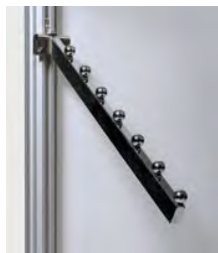
Waterfall with Hooks