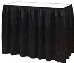
Skirted Counter - 42" High 4ft., 6ft.