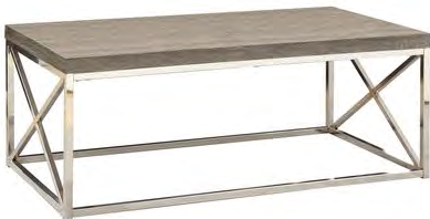
Chrome Coffee Table