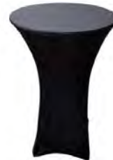
Spandex Cocktail Table Cover