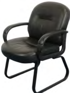
Leather Meeting Chair