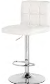
Leather Pump Stool