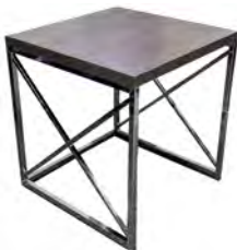
Chrome End Table - Square