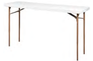
Unskirted Counter - 42" High 4ft., 6ft.