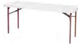
Unskirted Table - 30" High 4ft., 6ft., 8ft.