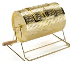
Small Ballot Drum