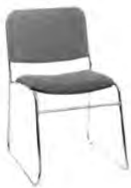
Grey Fabric Side Chair