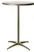
Starbase Table - 40" h (cocktail table)