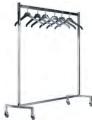
Garment Rack on Wheels