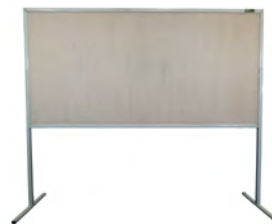
4' x 8' Posterboard

Colors may vary due to facility lighting, printing limitations and dye lot differences. Some items may not be available at all locations. See order form for details. Styles of items portrayed on this brochure may vary in some locations.