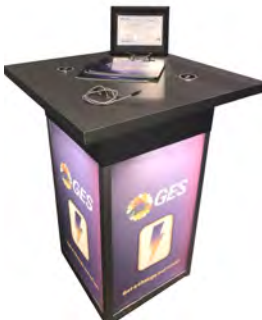
Cocktail Charging Station with Backlit Graphics

Colors may vary due to facility lighting, printing limitations and dye lot differences. Some items may not be available at all locations. See order form for details. Styles of items portrayed on this brochure may vary in some locations.