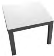
End Table - Square