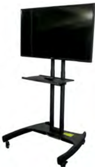
Rolling TV Stand