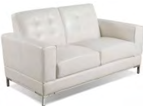
Leather Love Seat - 2 Seater