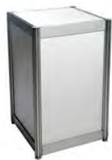
28" High Pedestal