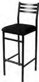
Ladder Back Stool