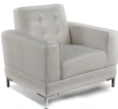
Leather Club Chair - 1 Seat