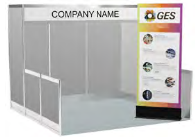
38"w x 84"h Vertical Sign with Stand