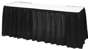
Skirted Table - 30" High 4ft., 6ft., 8ft.