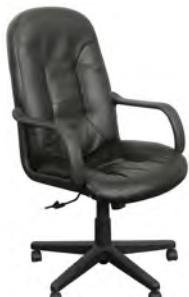
Executive High Back Leather Chair