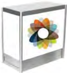
Storage Counter with Front Graphic Panel