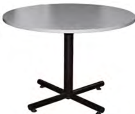
Meeting Table - 42" diameter