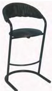
Low Back Stool