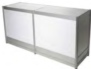
Storage Counter - 80"