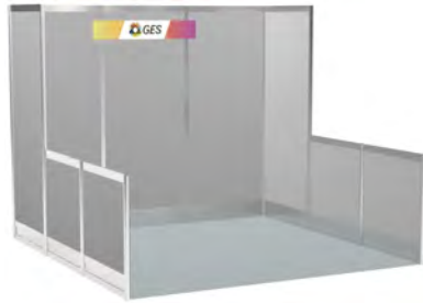
47"w x 7"h Booth ID Sign