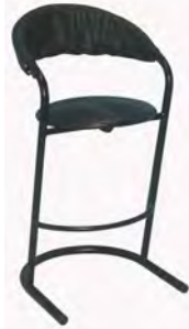
Low Back Stool