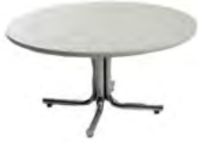
Starbase Table - 18" (coffee table)