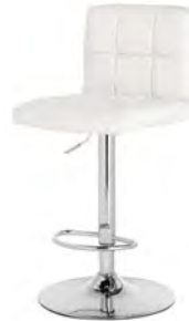
Leather Pump Stool