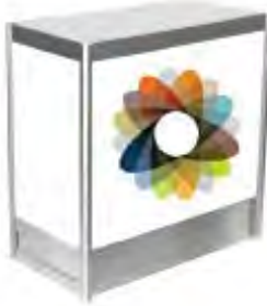
Storage Counter with Front Panel Graphic - 40"