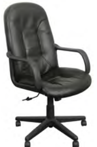
Executive High Back Leather Chair