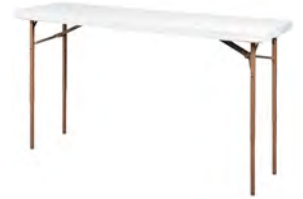
Unskirted Counter - 42" High 4ft., 6ft.