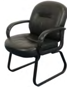
Leather Meeting Chair