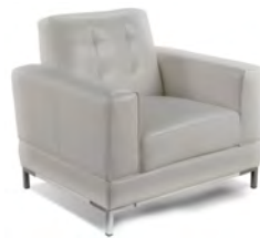
Leather Club Chair - 1 Seat