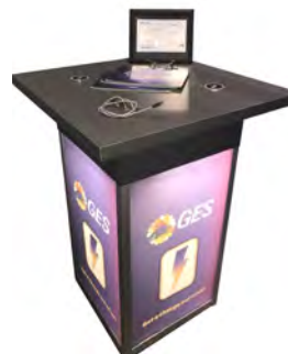
Cocktail Charging Station with Backlit Graphics

Colors may vary due to facility lighting, printing limitations and dye lot differences. Some items may not be available at all locations. See order form for details. Styles of items portrayed on this brochure may vary in some locations.