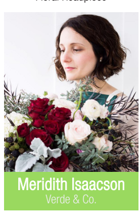
SPACE IS LIMITED!

All workshop packages include Festival admission, materials to create a floral arrangement with instruction from a professional florist, a beverage of your choice (selection of alcoholic or non-alcoholic), and finished product to take home.