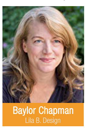
SUNDAY Hand-Tied Bouquet