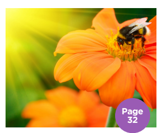
Sharing the Earth: Attracting Beneficial Pollinators and Wildlife