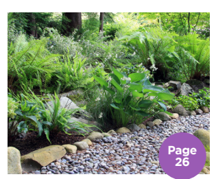
Solving Design Challenges with Style: Artistic Inspiration for Every Garden