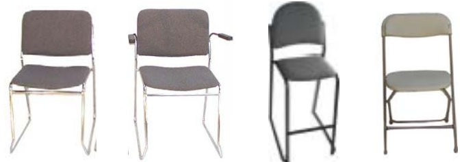
Padded Side Chair Padded Arm Chair Stool Counter High Folding Chair