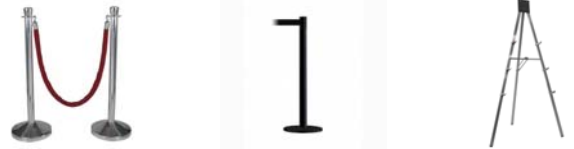
Chrome Stanchion Retractable Crowd Control Floor Standing Easel