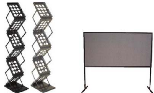
Literature Rack Poster Board