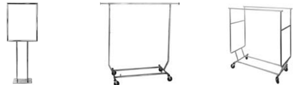
Sign Card Holder Coat Rack Single Arm Coat Rack Double Arm