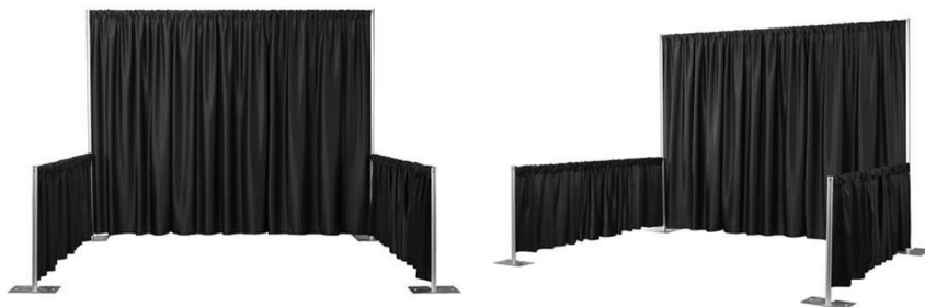
Exhibit booths will have an 8' draped back wall. On each side, a draped side rail will extend from the back of the booth to the front of the booth at a height of 3'. The drape color is black.

Tables, chairs, electricity etc. are not included with the cost of your exhibit space.